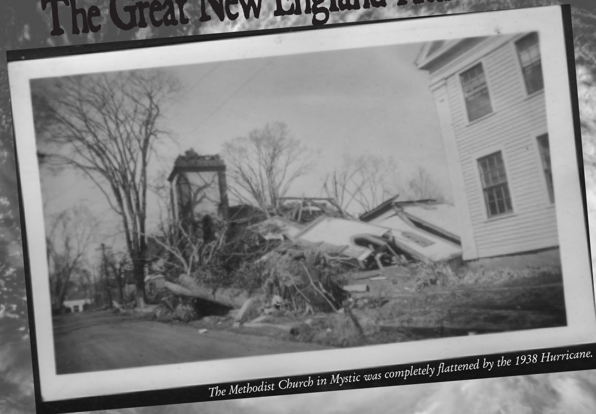
The Methodist Church in Mystic was completely flattened by the 1938 Hurricane.

On September 21, 1938, a category 3 hurricane unexpectedly roared up the Atlantic seaboard and fell upon an unprepared Long Island and New England. Six hundred lives were lost. Property destruction was over $300 million in 1938 dollars. Changes to the landscape are still visible today. The Mystic River Historical Society invites you to their monthly meeting in the Fellowship Hall of the Mystic Congregational Church on Wednesday, September 24 at 7:30 p.m. when Louis Allyn will present an illustrated lecture on the topic “What would it be like if the ’38 Hurricane happened today instead of 70 years ago?”