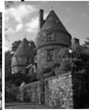
Gifford Pinchot's Grey Towers House (upper left) and the Daniel Boone Homestead (lower right.)