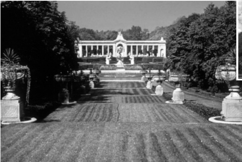
The Gardens at Nemours Mansion - the former estate of Alfred I DuPont.